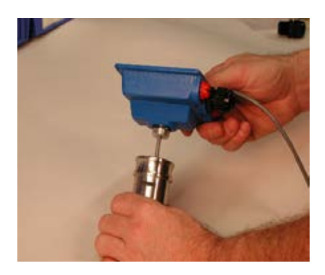
2. Attach WMK