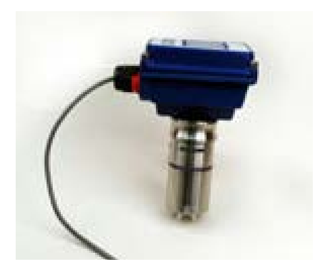
Assembled Meter with Electronics