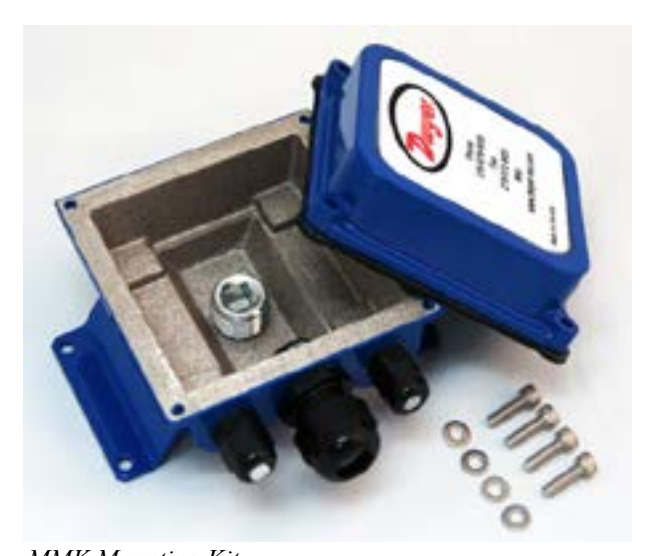
MMK\ Mounting\ Kit

The housings themselves are the same rugged, fusion coated cast aluminum enclosures used on other products. The electronic modules are physically interchangeable.