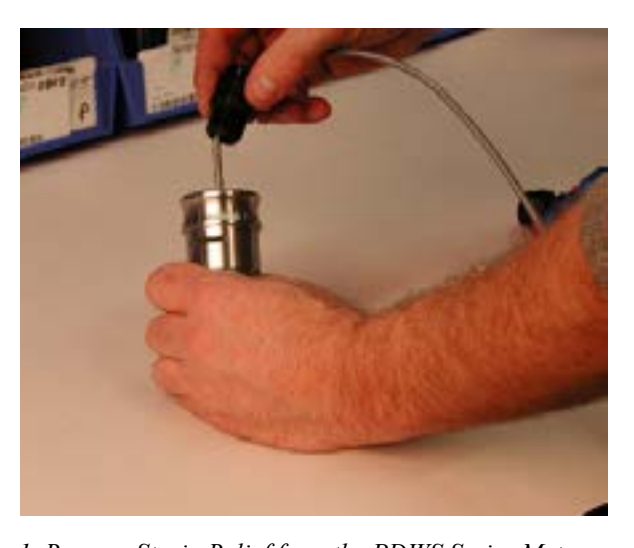
1. Remove Strain Relief from the PDWS Series Meter