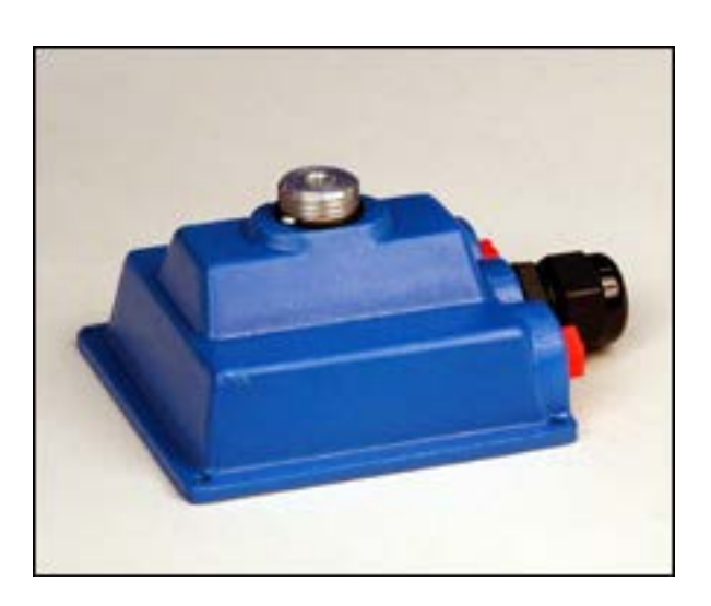
WMK Adapter Kit

Dwyer Instruments Inc. offers two mounting kits, which address the need for a more modular housing system. The photos show how a flow computer analog transmitter or pulse divider can be mounted on a PDWS Series flow sensor using a WMK Kit.