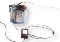
USB HART Modem

The MODEL DEVCOM2000 HART® Communicator Software turns your PC into a full-featured HART® communicator. Now it is possible to configure transmitters and control valves at the desktop or in the field. DevCom2000 uses device descriptions (DDs) to retrieve data that is stored in the memory of smart field devices. This software is a simple, reliable and secure method to add new measurement values to control systems without the need of additional wires. This software eliminates the need to purchase and maintain a separate handheld HART® communicator.