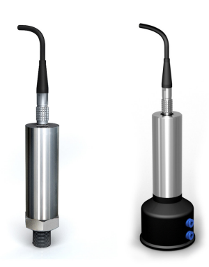
Gauge pressure Differential pressure