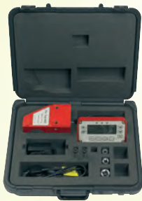
Pro-Test display and transducer in carry case.