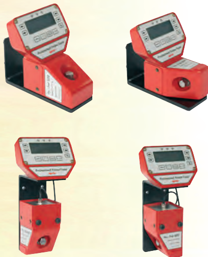
Flexible mounting options of Pro-Test on Bracket, Part No. 62198