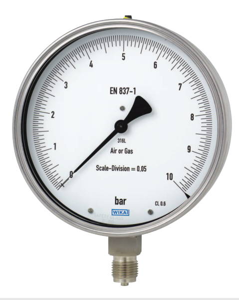
Test gauge series, stainless steel, model 332.50