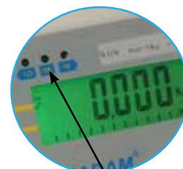
Colored LED indicators