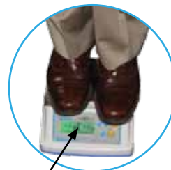
Advanced overload protection